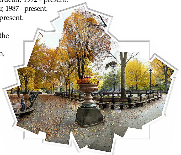
"Central Park Floral Offering, NYC" 2003, 38" x 34" Pigmented ink on archival paper, edition of 15