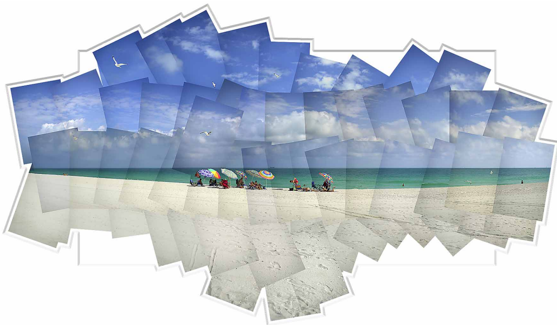
"The French Establish a Beachhead in Miami" 2004 54" x 34" Pigmented ink on archival paper, Edition of 12